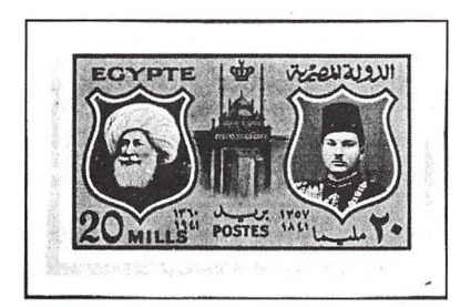
Fig. 3 The dynasty commemorative (photographic essay).

Preparations for an issue to commemorate the dynasty founded by Mohammed Ali, of which King Farouk was the last crowned representative (his son, Prince Ahmed Fuad, never assumed the throne), were begun in 1941, but the stamps never came to fruition, presumably for political reasons and the circumstances of World War II. Lot 2487 of the Robson Lowe International auction in Basel in 1979 contained artist's essays by Hewitt (illustration included) (Fig. 3).