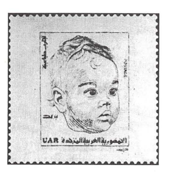
Fig. 6 Recess printed essay.

In experimenting with the newly acquired facility for recess printing, an essay showing a small child was produced, printed as a die proof in blue (Fig. 6).