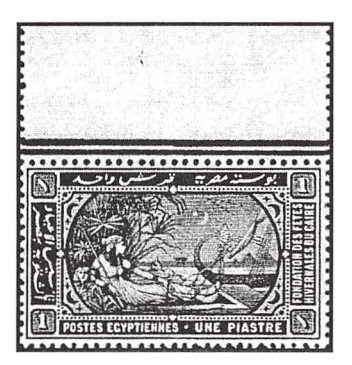
Fig. 2 The Nile Fête design.

exist for the vignette and for the three value frames. A large variety of bicolored color trials were sent to Egypt, but the final decision was for monocolor. A small quantity of the unissued sheets came on the market with the liquidation of the De La Rue archives.