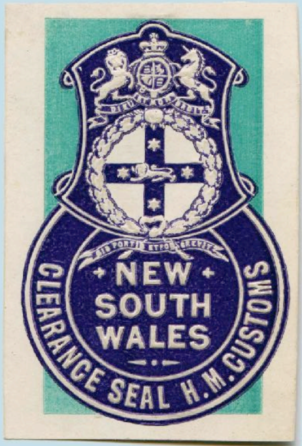
Design Embossed on thin card - Imperf

Imperf Proof of Accepted Colour for the Port of Newcastle and Issued Seal