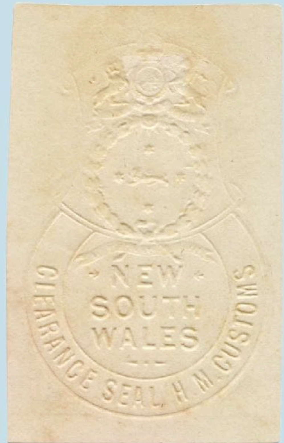
Green backing frame 33mm x 61mm Reverse / Horizontal Flip Design Embossed on thin card - Imperf