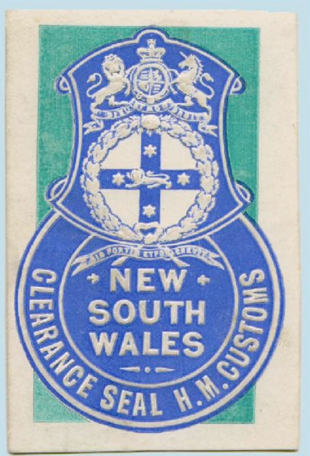
Green backing frame 33mm x 61mm Design Embossed on thin card - Imperf