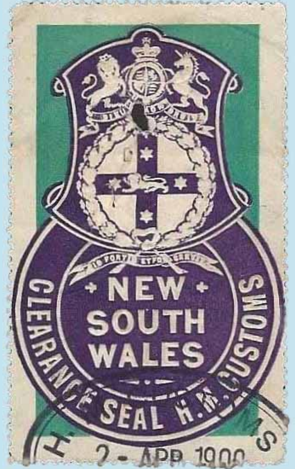
Issued Design Embossed - Perforation 12