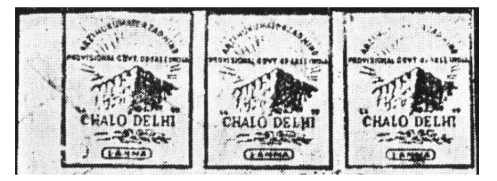
Illustration of "GOVT." type with weak details in upper design, from Adgey-Edgar

On the other hand, a forger working from a poor print or illustration of the "GOVT." stamp, in which these details were not clearly visible, would not know to put them in. Likewise, an image in which the tiny word "GOVT." was not clearly readable could mislead the forger into producing the "GOVERNMENT" version, prompted by one of the helpful reports that clarified things by spelling out the word in full. Conversely, the fort, "CHALO DELHI" lettering and foreground foliage are all very closely copied, perhaps photographically, though all a little larger in proportion than in the original. So our hypothetical forger would also need an image in which these elements were clear. Putting all this together, can we find such an example from which the "GOVERNMENT" version could have been generated?