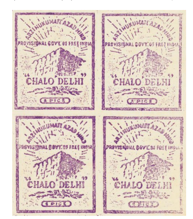
1 pice block bought by Lim Peng Hong in 1945, cols 5/6, rows 5/6 [left], matched with the same positions from the full sheet of reprints [right] – note relative positions of frame lines. Small plate flaws and idiosyncrasies also match.